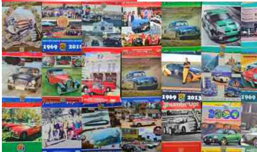
A Montage of some of the more Modern Day Magazine Covers

At a recent Committee Meeting The Magazine was being discussed, Bruce Dixon said he had copies dated from the beginning of the Clubs formation and he would pass them on to me for possible inclusion in our present magazines. With that, I will be starting a regular feature each month with items of interest extracted from these early documents. The first few years there were only fullscap sized roneoed sheets sent out to all members. some very interesting tit bits have come to light.