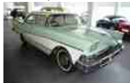
1958 Ford Fairlane 500 R65 000