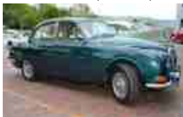
1964 Jaguar 3.8S R160 000