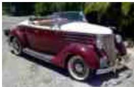
1936 Ford Roadster R340 000