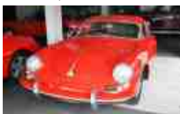
1962 Porsche 356B R550 000