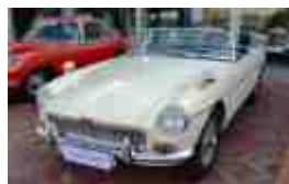
1967 MGB R140 000