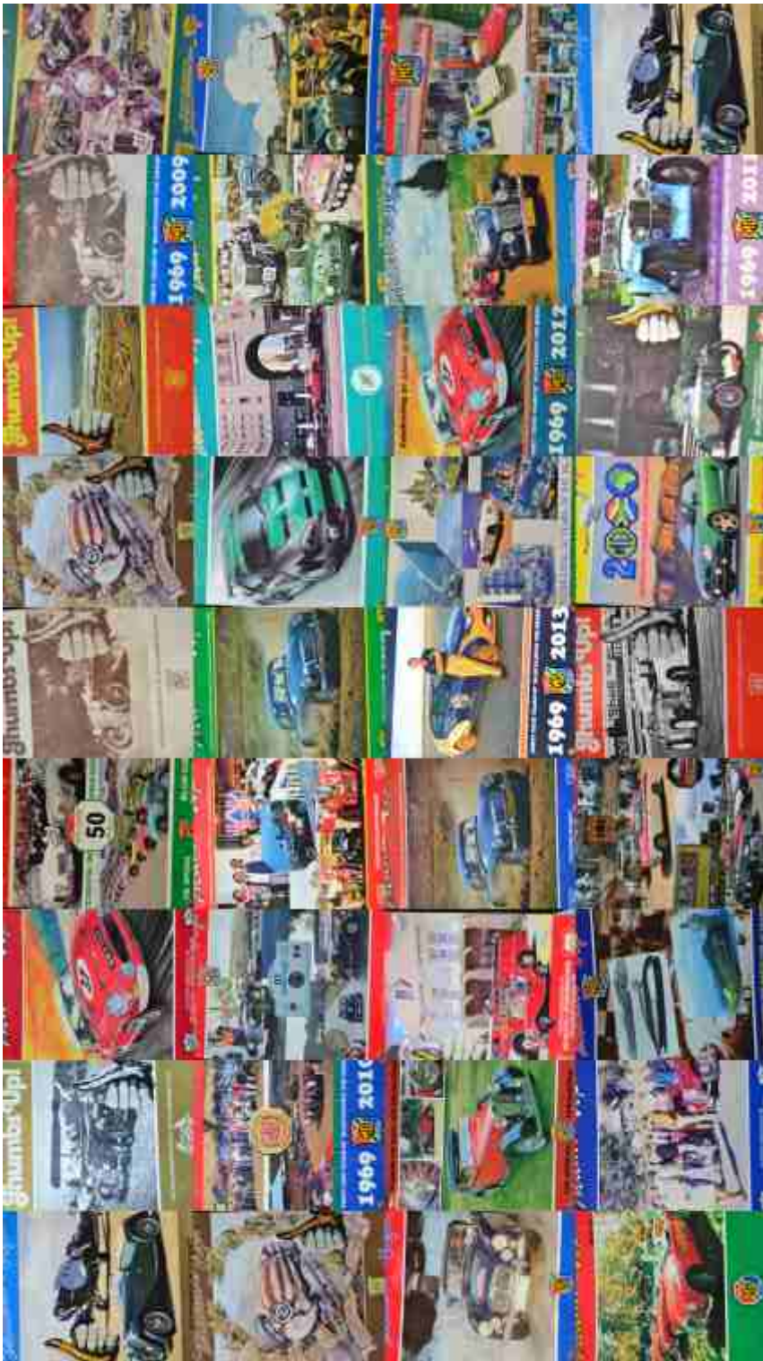
A Montage of some of the more Modern Day Magazine Covers