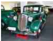
1934 Chev Master Sedan R140 000