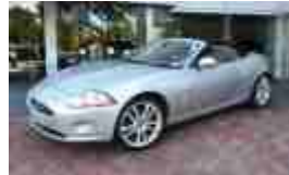
2007 Jaguar XK R480 000