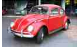
1964 VW Beetle 1300 R65 000