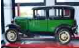
1930 Model A Ford R120 000