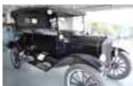
1924 Model T Ford R240 000