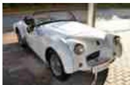
1955 Triumph TR2 R175 000