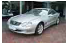
2002 Mercedes 500SL R380 000