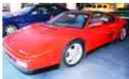
1991 Ferrari 348TS (4 000 kms) R980 000

Our Showroom/Workshop is located at 70, Main Road, Knysna We buy and sell all classic, sports and vintage cars. Consignment sales welcome.