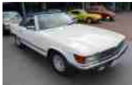
1983 Mercedes 500SL R140 000