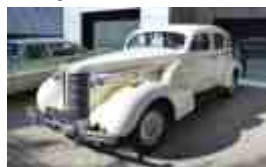
1938 Buick Special R180 000