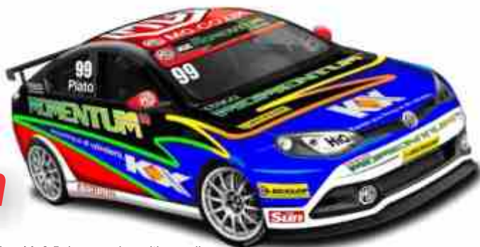
New Mg6 5 door version with new livery

MG Motor UK has signed double touring car Champion Jason Plato to spearhead its new three-year assault on the British Touring Car Championship. The manufacturer will join the series with two five-door MG6 cars run under the auspices of the MG KX Momentum Racing Team. The cars will