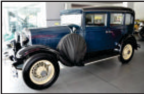
1928 Upmobile – R228 000

1966 FORD MUSTANG In absolutely immaculate condition, this beautiful vehicle has been the pride, joy and prized possession of her owner for many years. Shiny black with a red interior, she sports a red vinyl roof - only 9% of these were ever made. Roadworthy and licensed for South African roads, this LHD beauty is 100% original and is one of the extremely popular "Pony" Mustangs - P.O.A.