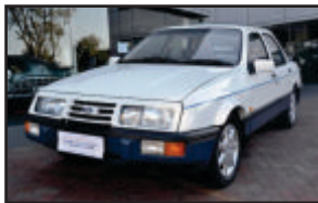
1984 Ford Sierra R8 – R258 000