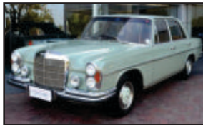
1972 Mercedes Benz 280S – R95 000