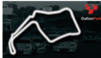
06-07 Jun Oulton Park