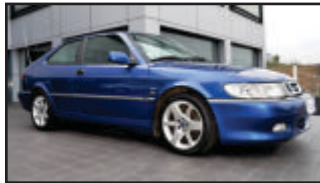
2002 Saab 93 – R70 000