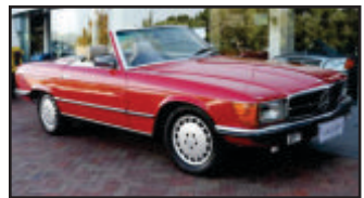
1982 Mercedes Benz 500 SL – R140 000