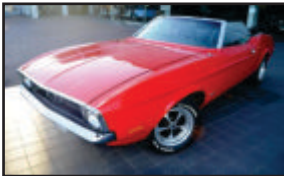
1971 Ford Mustang – R380 000