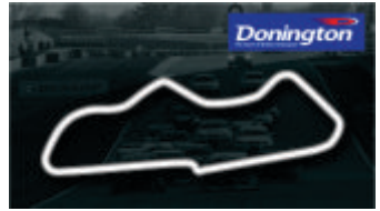
18-19 Apr Donington Park