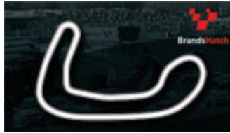
04-05 Apr Brands Hatch Indy