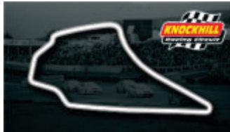
22-23 Aug Knockhill