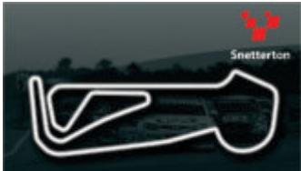
08-09 Aug Snetterton