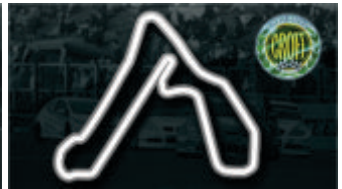
27-28 Jun Croft