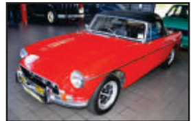
1972 MGB – R118 000

ALS 1973 Rover 3.5 V8... 1967 MGB Roadster... 1967 MGB GT... 1969 Rambler Rogue... 1937 Mercedes Benz 170V... 1950 MG TD 1934 Studebaker Dictator... 1980 Mercedes 280SL... 1968 Wolseley 1660... 1986 Porsche 924S... 1958 Buick Special... 1974 Volvo 164 1958 De Soto... 1964 MGA... 1983 Porsche 944... 1935 DKW Cabriolet... 1967 Jaguar MK2... 1936 Chevrolet... 1971 MGB Roadster... 1941 Chevrolet Panel Van... 1978 Buick Park Avenue... 1952 Opel Kapitän... 1955 Ford Customline... 1984 Porsche 944... 1946 Lincoln Sedan... 1965 Mercedes Benz 230S Fintail... plus...plus...plus.