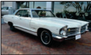
1965 Pontiac Parisienne – R128 000