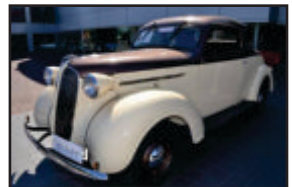
1938 Plymouth Doctors Coupe – R165 000