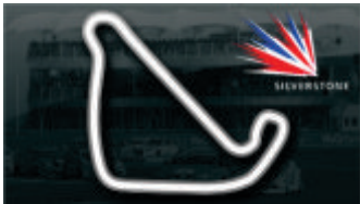
26-27 Sep Silverstone