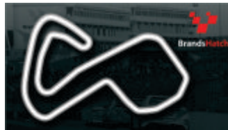
10-11 Oct Brands Hatch GP