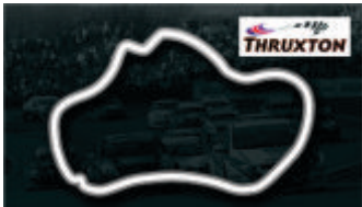
09-10 May Thruxton