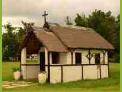
The small church by the river that used to be a stable

at the Vaal River. Kevin's Pictures tells the whole story