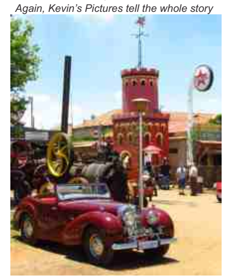
Where steam & petrol meet at Sylviavale Museum

Here is an opportunity for a Social Evening Run for our MG members. When shall I arrange something, before it gets too chilly in the evenings?