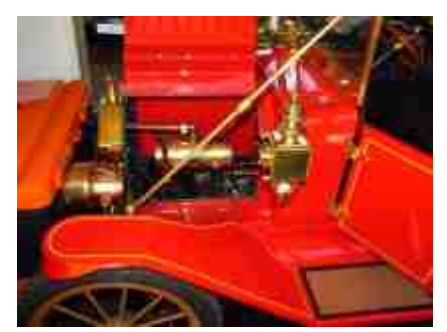
Part of a scale model T Ford built by Albert Pollev over 17 years fitted with a Yamaha 50cc engine