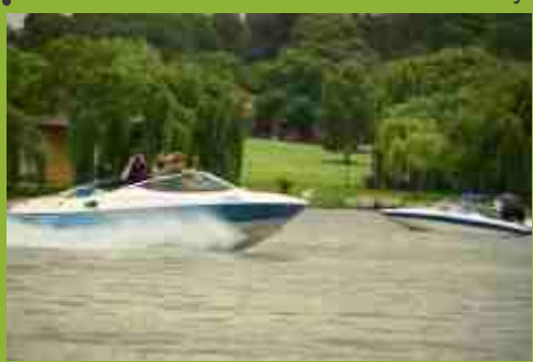
Taking pictures of each other - a boating playground on the Vaal river.