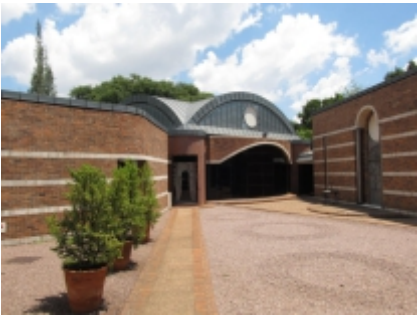
The walk way to the Brenthurst Library