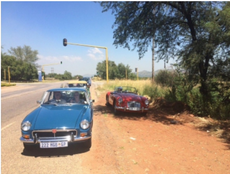
On the way