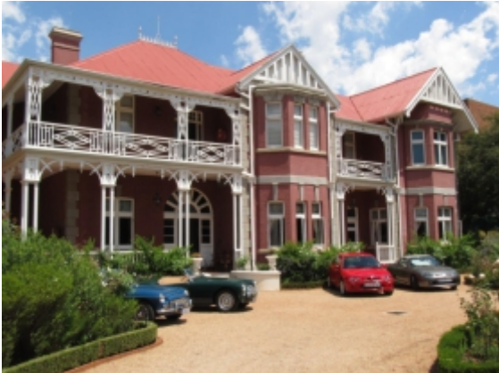
"The View" originally built by the Cullinan family in 1896