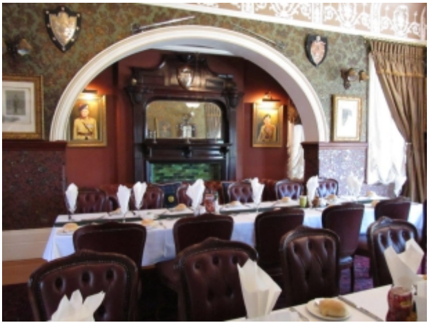
Lunch venue at "The View" in the old billiard room