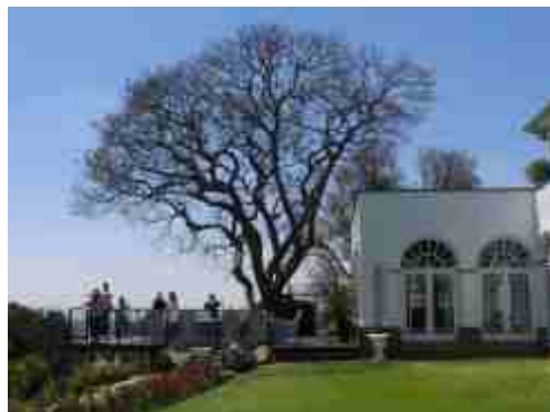
The house, deck & view that Norman enjoyed