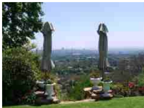
Part of the view of the northern suburbs from the ridge