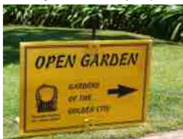
Eight gardens on show, all in walking distance - marvellous