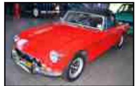
1972 MGB – R118 000

ALS 1973 Rover 3.5 V8... 1967 MGB Roadster... 1967 MGB GT... 1969 Rambler Rogue... 1937 Mercedes Benz 170V... 1950 MG TD 1934 Studebaker Dictator... 1980 Mercedes 280SL... 1968 Wolseley 1660... 1986 Porsche 924S... 1958 Buick Special... 1974 Volvo 164 1958 De Soto... 1964 MGA... 1983 Porsche 944... 1935 DKW Cabriolet... 1967 Jaguar MK2... 1936 Chevrolet... 1971 MGB Roadster... 1941 Chevrolet Panel Van... 1978 Buick Park Avenue... 1952 Opel Kapitän... 1955 Ford Customline... 1984 Porsche 944... 1946 Lincoln Sedan... 1965 Mercedes Benz 230S Fintail... plus...plus...plus.