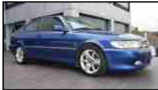
2002 Saab 93 – R70 000