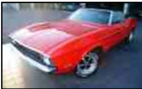
1971 Ford Mustang – R380 000