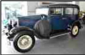
1928 Upmobile – R228 000

1966 FORD MUSTANG In absolutely immaculate condition, this beautiful vehicle has been the pride, joy and prized possession of her owner for many years. Shiny black with a red interior, she sports a red vinyl roof - only 9% of these were ever made. Roadworthy and licensed for South African roads, this LHD beauty is 100% original and is one of the extremely popular "Pony" Mustangs - P.O.A.