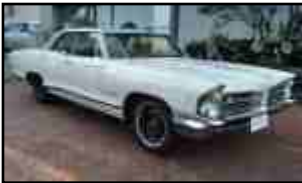
1965 Pontiac Parisienne – R128 000