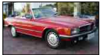
1982 Mercedes Benz 500 SL – R140 000