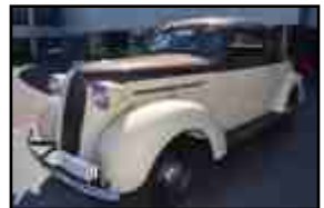
1938 Plymouth Doctors Coupe – R165 000