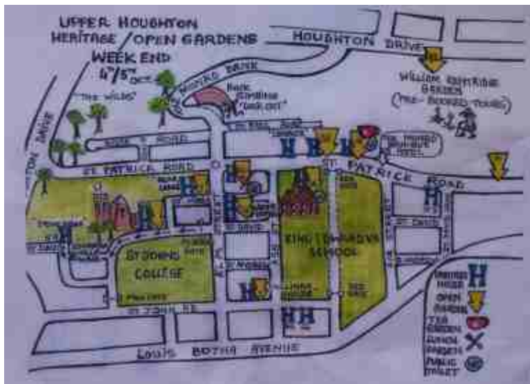
Map showing the gardens on show

This city actually has a great deal to offer and it is opportunities like this that we should take through the year to explore and discover a bit more about hidden gems of Johannesburg.