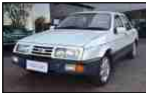
1984 Ford Sierra R8 – R258 000