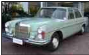
1972 Mercedes Benz 280S – R95 000