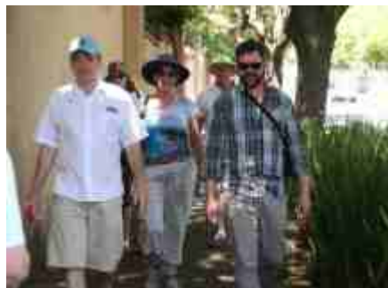
More MG folk heading back for lunch