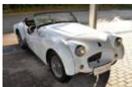
1955 Triumph TR2 R175 000