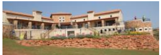
A view of Le Club from below