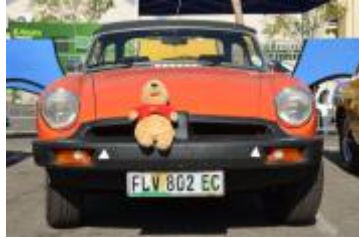
Pooh Bear attempting to hitch a ride on Rod Paxton's MGB