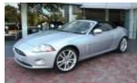
2007 Jaguar XK R480 000