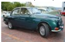
1964 Jaguar 3.8S R160 000