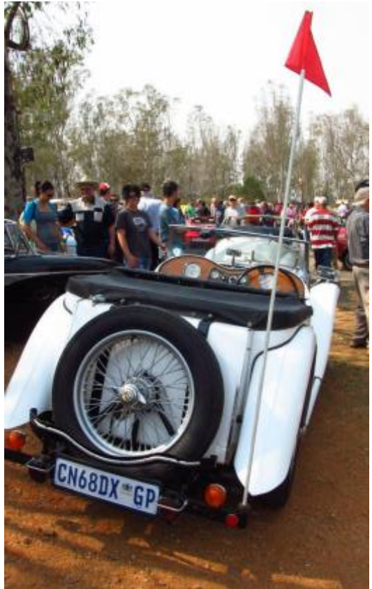
The risks of travelling in a TC on Gauteng's roads. This TC has a red flag for additional visibility.

The total raised was over R14,000 and this will go a long way towards keeping the cars and drivers on the track, and flying the MG flag! Our next event is the Historic Racing Round 7 to be held at Kyalami on 19 October, we hope to see you there supporting the MG team!