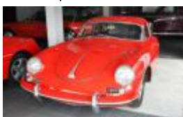
1962 Porsche 356B R550 000