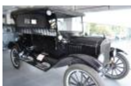
1924 Model T Ford R240 000