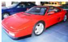
1991 Ferrari 348TS (4 000 kms) R980 000

Our Showroom/Workshop is located at 70, Main Road, Knysna We buy and sell all classic, sports and vintage cars. Consignment sales welcome.