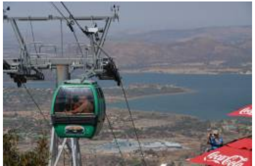
A view from the top of the cable way overlooking the dam