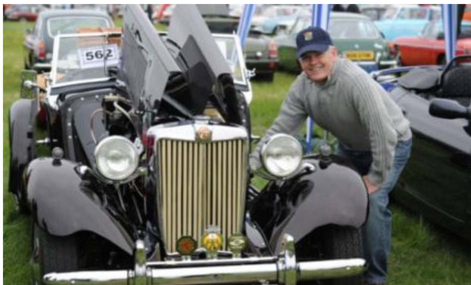
Ah, Molly! Still a good looking wee car, despite the ageing owner!