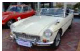
1967 MGB R140 000