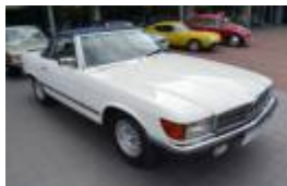
1983 Mercedes 500SL R140 000