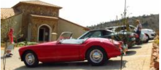
Parking outside the club house