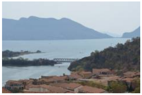
The view from Le Club @ Estate D' Afrique overlooking the Crocodile River & Hartbeespoort Dam