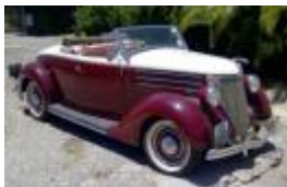
1936 Ford Roadster R340 000