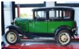
1930 Model A Ford R120 000