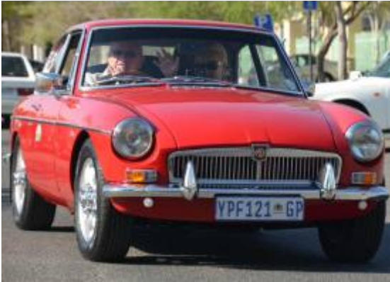
The royal wave from the Mercer-Tods