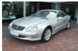
2002 Mercedes 500SL R380 000