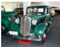
1934 Chev Master Sedan R140 000