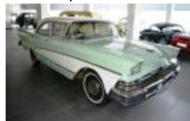
1958 Ford Fairlane 500 R65 000