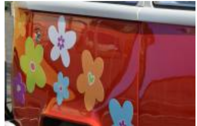
Flower power - what's needed to get a VW Combi around Zim