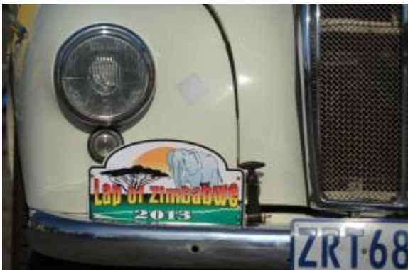
The tour's rally plate on Roger Pearce's ZB Magnette