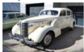
1938 Buick Special R180 000