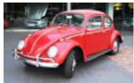
1964 VW Beetle 1300 R65 000