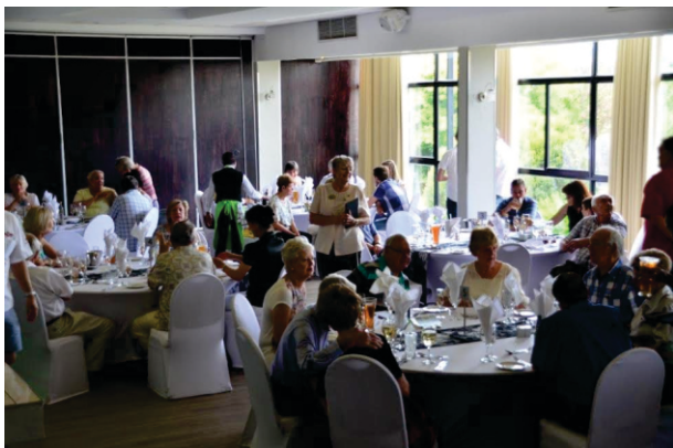
One half of the dining area; close to 60 folk enjoyed themselves