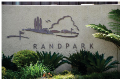
Many thanks for a super lunch at a pleasant venue - an excellent choice