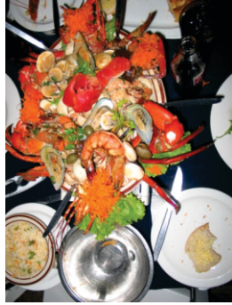
Seafood cuisine in true Portuguese fashion!

Upon receipt of your booking we will supply you with regulations, official entry form and other information.