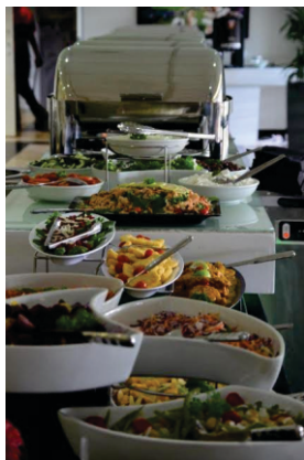
Part of the buffet lunch; no shortage of good food