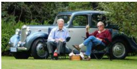
The brothers Kirkland about to have lunch