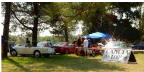
Congratulations to Lancia on their 100th anniversary