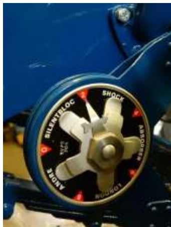
Silentbloc shock absorbers - definitely different