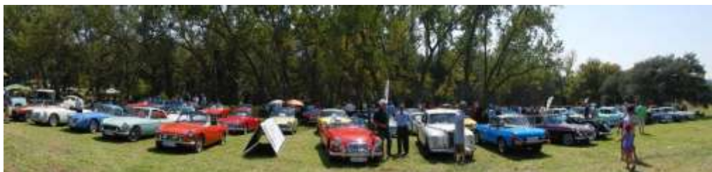
A fair collection of MGs present on the day