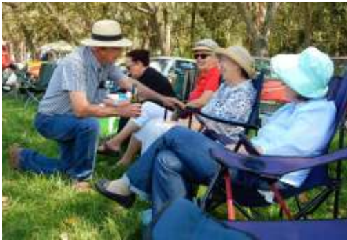
Our chairman chatting up the ladies