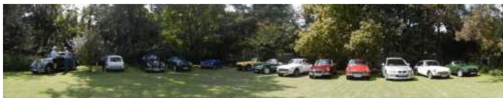
The reason for the outing, Cecil Kimber's birthday celebration