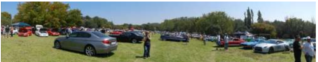
Good weather ensured a great turnout from a host of clubs