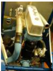
Tiny motor that packed a punch for its' day